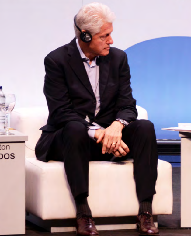
The Third Way Summit. Panelists Bill Clinton, Juan Manuel Santos, and Tony Blair. Simultaneous interpretation in Spanish and English.